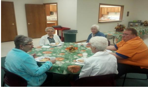
Alpha Course members enjoying a meal before the class starts

MISSION TEAM: The Mission Team will be collecting food for holiday baskets in November & December. Thank you to everyone who donated coats, gloves, mittens, etc... It is greatly appreciated.